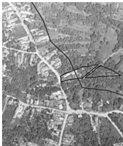
Figure 1. Zone positioning ortofotoplan

In order to make the job, it was necessary to consider the building as a emplacement on the work site, identify the network support point and picketing of the network stations.