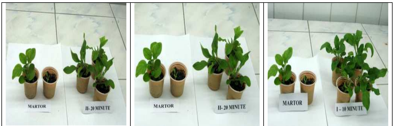
Figure 3: . WHITE CASCADE variety petunia seedlings 30 days after irradiation and sowing

In the case of seed Garofita ( Dianthus caryophyllus -var.CHABAUD: KONING Feuer) (Table 3), Series S1 illuminated with laser light additional continuous emission in the red following results were obtained: higher germination percentage than for all rehearsals witness of variant V1 discussed in two days of the start of experiments. Increase the maximum germination obtained after treatment with red light produced by the audio-frequency modulated laser was Registered in day-10 and was superior to control.