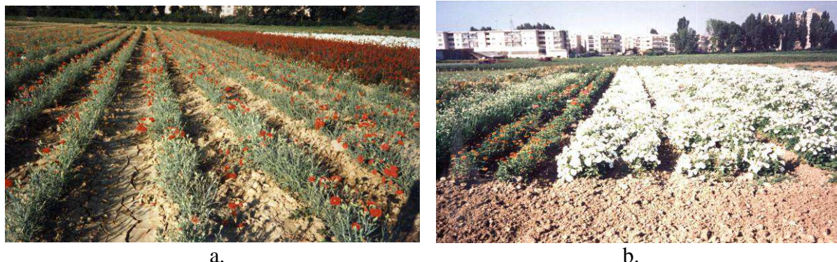
Figure 1. The appearance of lines and varieties of crops selected for biological material:

2. Plants of Petunia hybrida -, variety WHITE CASCADE, Fam. Solanaceae are annual, glandulous hairy, herbaceous, up to sufrutescente. Growth is high, erect, funnel-shaped flowers, simple, rich and persistent bloom (Figure 1.b)