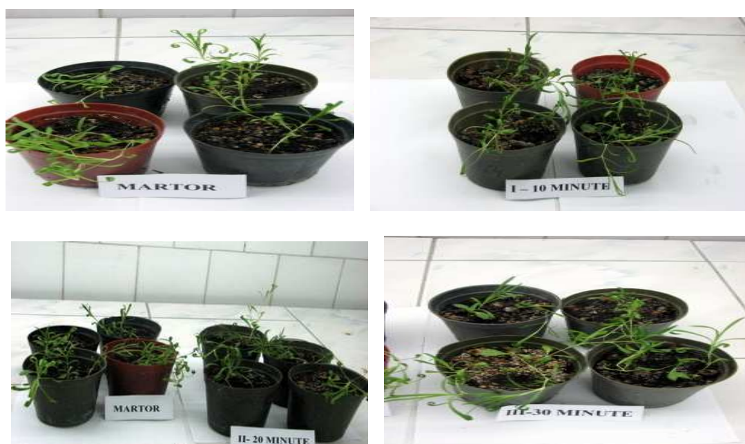
Figure 4. Variety KONING Feuer ( Dianthus caryophyllus -var.CHABAUD:) seedlings 30 days after irradiation and sowing

Figure 4 illustrates Dianthus seedlings resulting from germination of seeds on which treatment was applied to the diode laser light variant V1-V3 (10, 20, 30 minutes of irradiation with laser light) compared with those from version control / irradiated control.